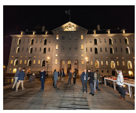
The venue for last night's awards

The Collaborative Solution between a Superyacht Builder and its Supply Chain Partner category, sponsored by Lumishore, went to Rondal, Comm&Sens and Gurit for their load sensing rudder for a Royal Huisman 81m sailing superyacht.