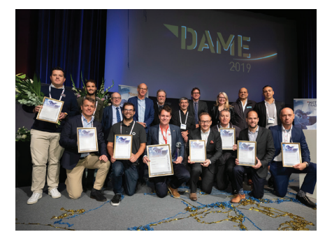
DAME 2019 winners take centre stage

The other category winners were Garmin GPSMAP 86i stand 01.101, 01.103, 01.200 (Marine Electronics and Marine Related Software), Lumitec Moray Flex Light stand 12.505 (Interior Equipment, Furnishing, Materials and Electrical Fittings used in Cabins), Lignia Yacht stand CMP 15 (Marina Equipment, Boatyard Equipment and Boat Construction